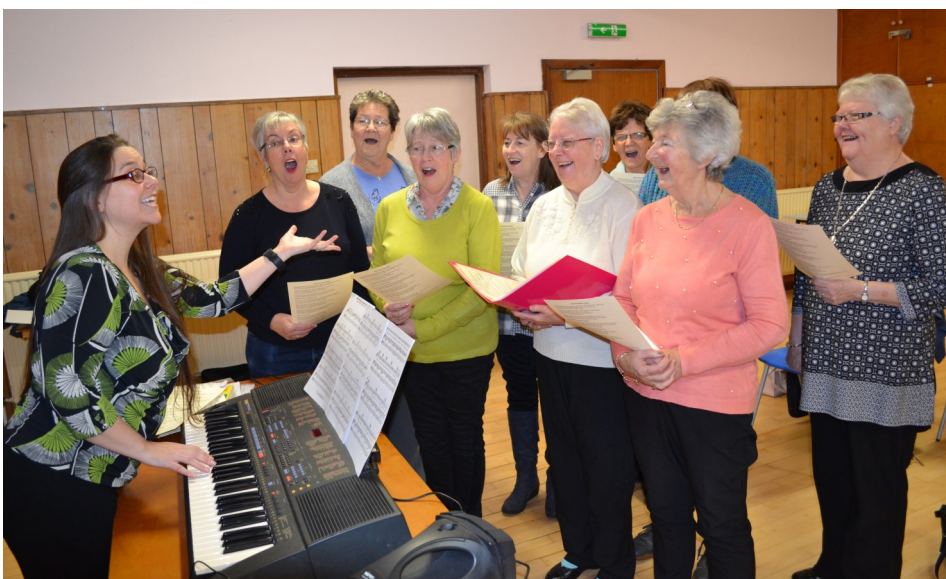
Singing for Fun Group. Picture taken pre-COVID restrictions

For our Thursday group book at: https://www.eventbrite.co.uk/e/142913796011