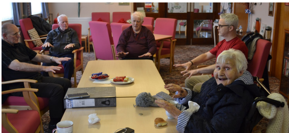
A keep fit group pictured pre-COVID restrictions

For our seated keep fit book at: https://www.eventbrite.co.uk/e/143704976453